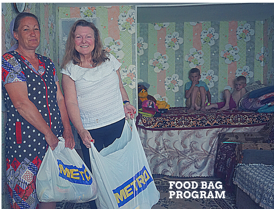
FOOD BAG PROGRAM