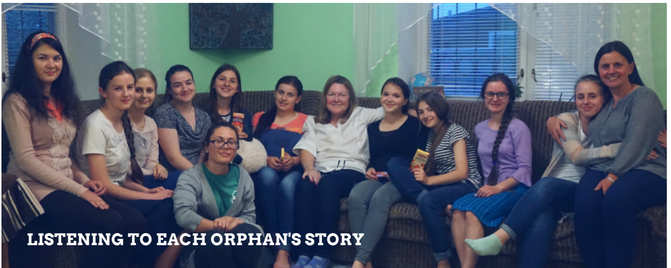
LISTENING TO EACH ORPHAN'S STORY