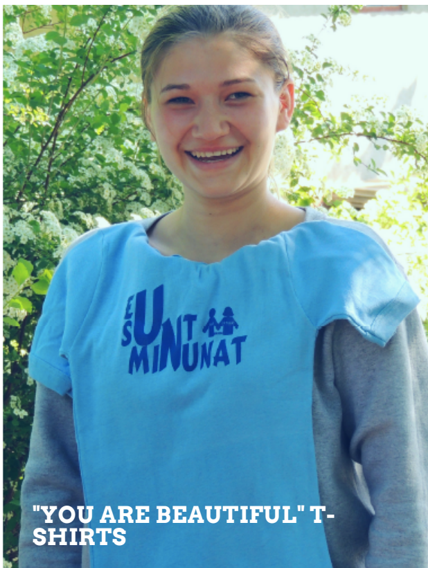
"YOU ARE BEAUTIFUL" T-SHIRTS

We gave out personalized t-shirts and hats with the message "you are beautiful." We spoke about the value of education as their key for future success and how to protect themselves from the dangers of human trafficking.