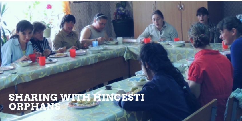
SHARING WITH HINCESTI ORPHANS