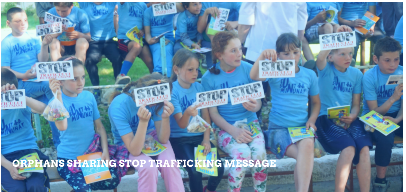
ORPHANS SHARING STOP TRAFFICKING MESSAGE