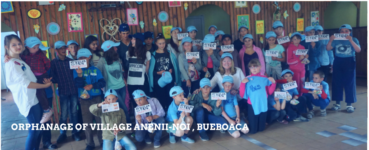
ORPHANAGE OF VILLAGE ANENII-NOI , BUEBOACA