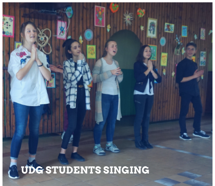
UDG STUDENTS SINGING