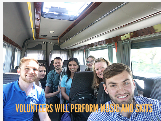
VOLUNTEERS WILL PERFORM MUSIC AND SKITS