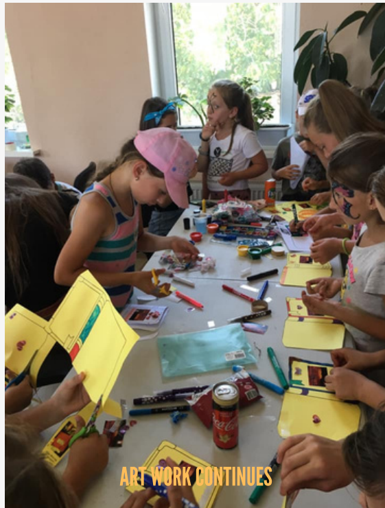
ART WORK CONTINUES