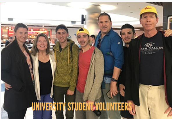
UNIVERSITY STUDENT VOLUNTEERS