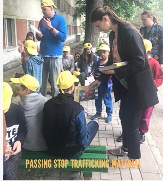
PASSING STOP TRAFFICKING MATERIAL