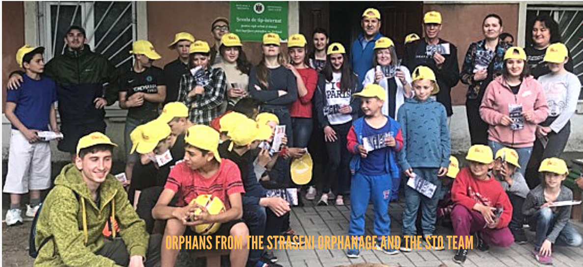
ORPHANS FROM THE STRASENI ORPHANAGE AND THE STO TEAM