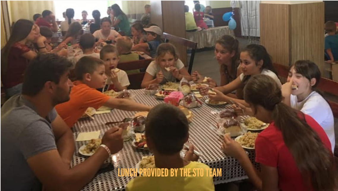
LUNCH PROVIDED BY THE STO TEAM