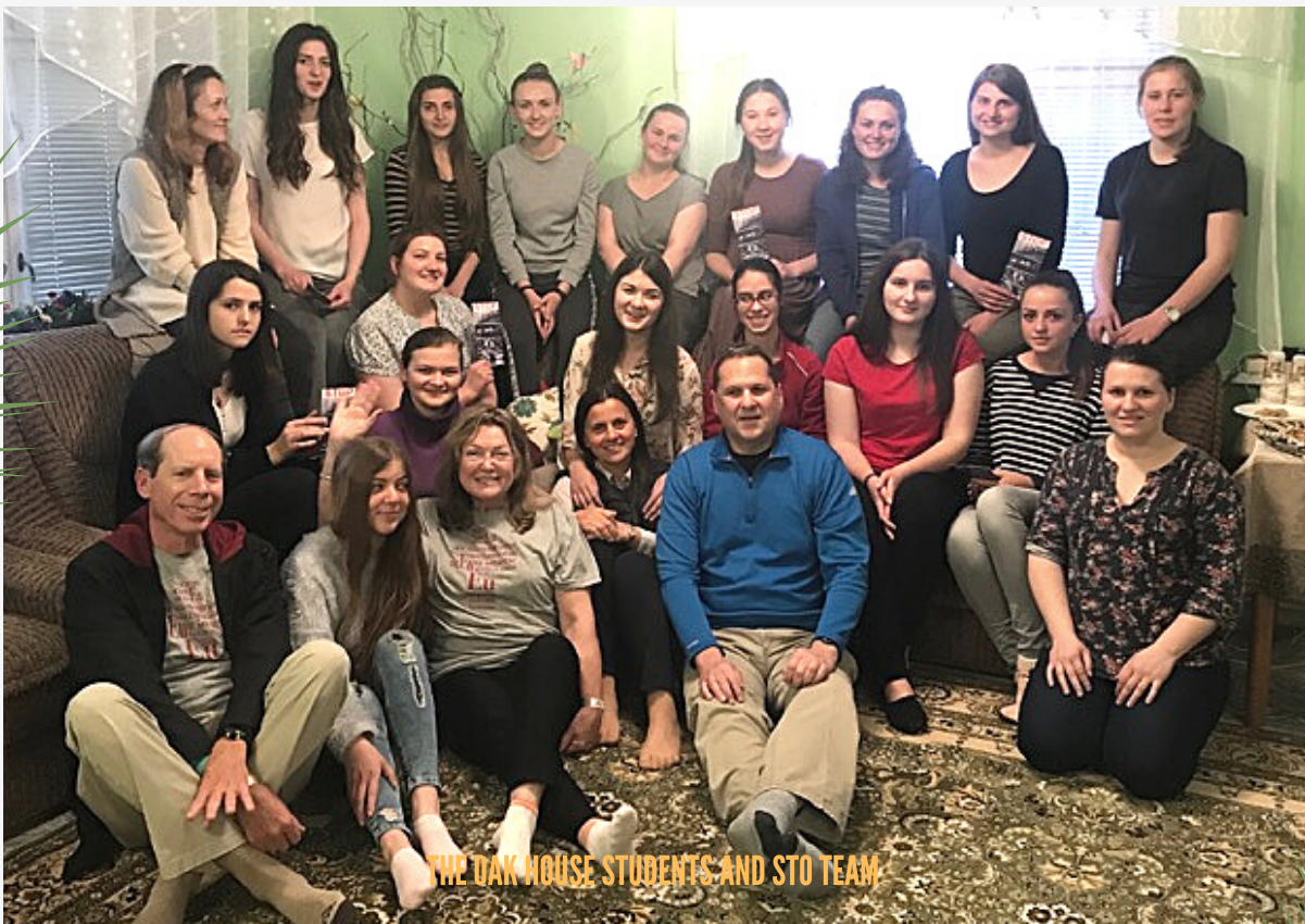
THE OAK HOUSE STUDENTS AND STO TEAM