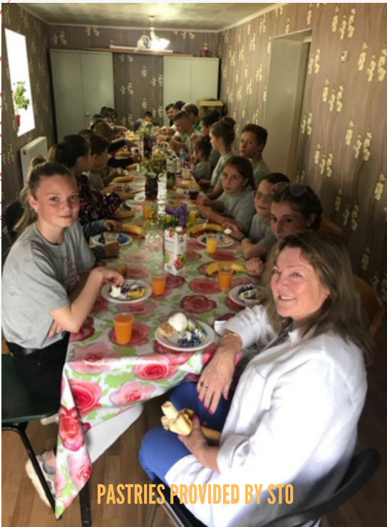
PASTRIES PROVIDED BY STO