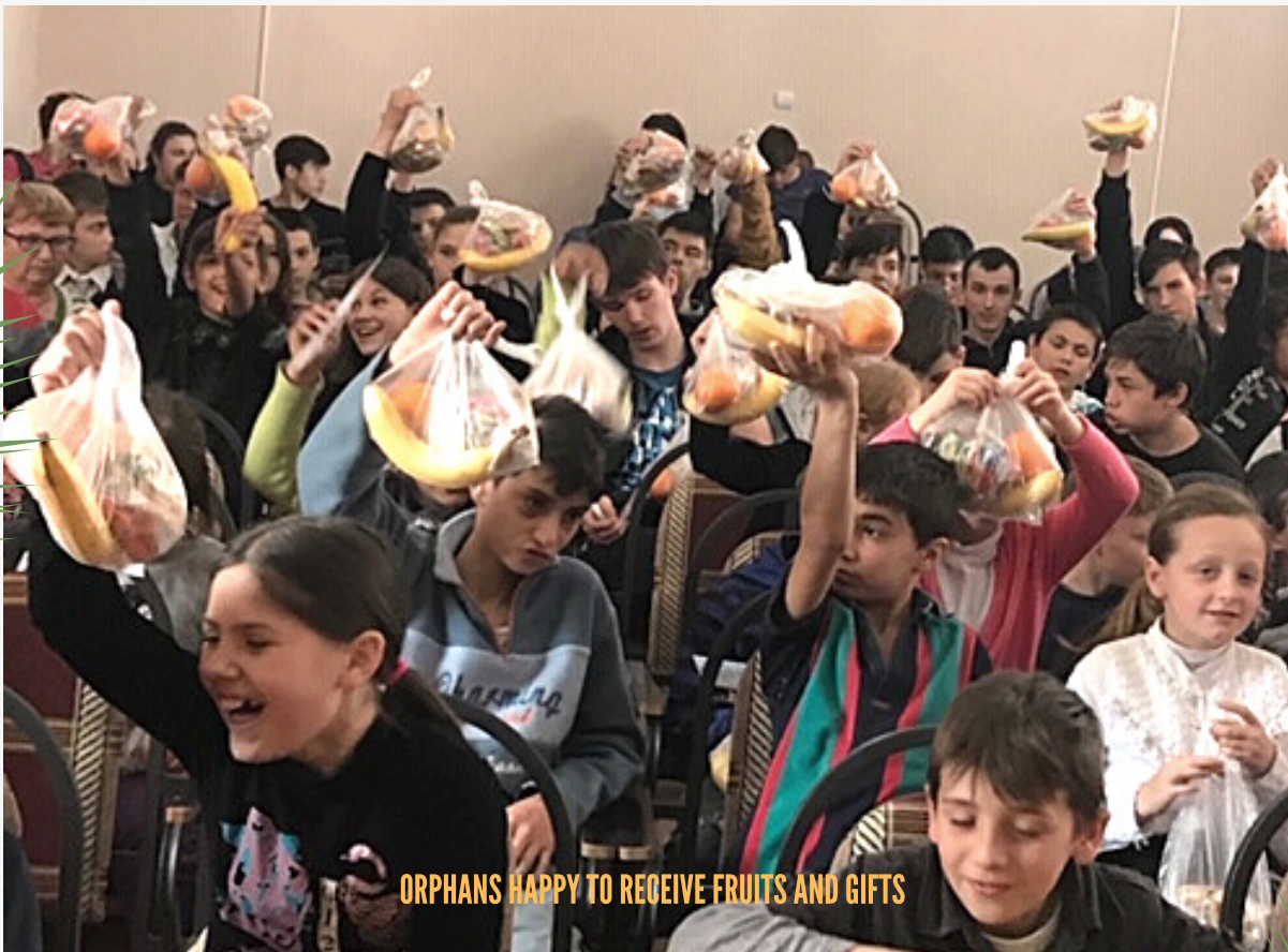
ORPHANS HAPPY TO RECEIVE FRUITS AND GIFTS