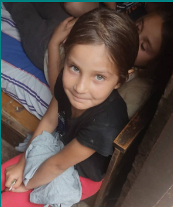
TANEA 8 YEARS OLD