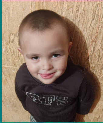
NIKU 2 YEARS OLD