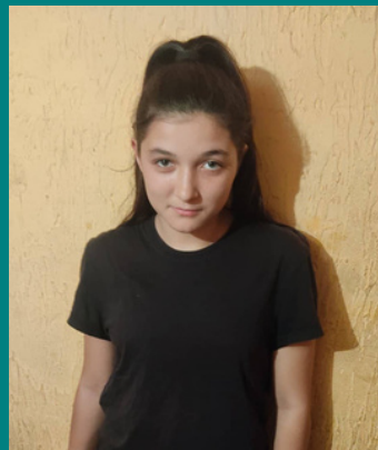
LIBA 15 YEARS OLD